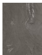
S948 On the Rocks