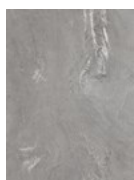
S959 Taken for Granite