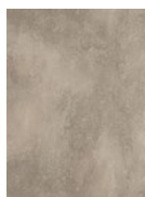
S818 Nature's Influence