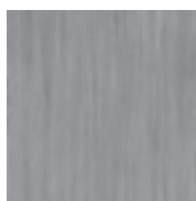
S939 Stone Cold