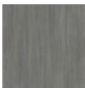
S945 Stepping Stone