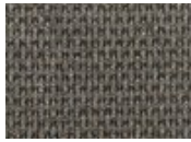
7978 Checking In