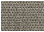
7959 Defining Moment