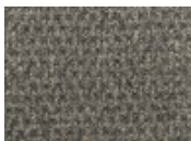
7679 Jump Start