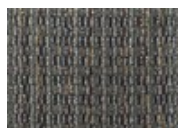
7989 Body Up Quickship Available