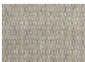
7978 Think Positive Quickship Available