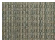
7698 Only Believe Quickship Available