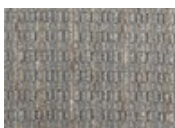
7988 Recharge Often Quickship Available