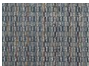
7588 Mind Set Quickship Available