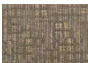
7855 Dynamic Taupe