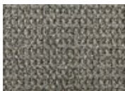
7599 Astute Solution