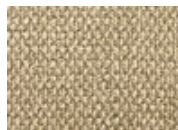
7846 Extraordinary View