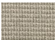
7939 Fantastic Turn