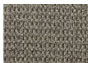
7979 Modern Explorations