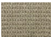
7959 Amazing Discovery