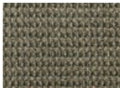
7769 Perfect Concept