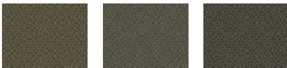
655 Pastoral 554 Keepsake 586 Daydream