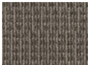
846 Get Moving