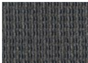
579 Advocate Change