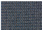
7595 Navy Pier