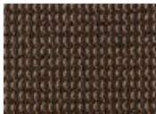
7378 Saucey Henna