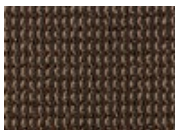
7378 Saucey Henna