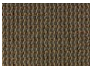
7128 Classy Khaki