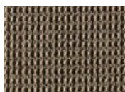
7989 Twilight Dawn