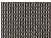
7969 Grey Matters