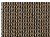
7989 Twilight Dawn