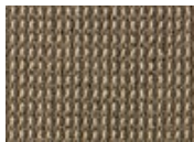
7862 Neutral Mix