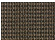
7888 Honest Earth