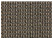
7858 Stoney Terrain