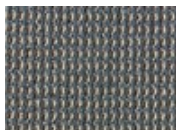
7585 Rushing River