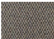
7888 Honest Earth