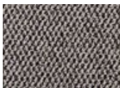
7969 Grey Matters