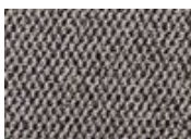
7969 Grey Matters