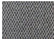
7585 Rushing River