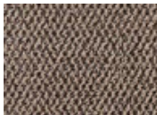
7378 Saucey Henna