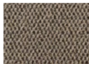
7989 Twilight Dawn