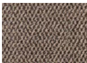
7378 Saucey Henna