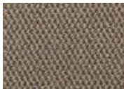
7128 Classy Khaki