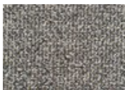
7558 Mixed Infusion Quickship Available