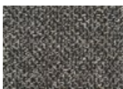
7989 Grounded Char