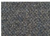
7579 Urban Indigo Quickship Available