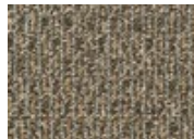
7831 Golden Umbers