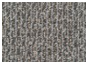
7558 Mixed Infusion Quickship Available