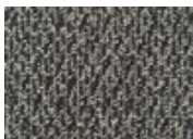
7989 Grounded Char Quickship Available