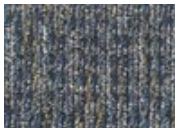
7579 Personal Style