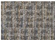
7558 Modern Attire