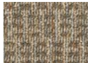
7831 Look Sharp