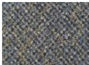
7579 Personal Style