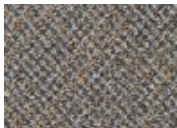
7558 Modern Attire