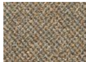
7831 Look Sharp