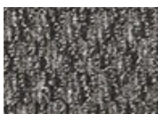
7989 Country Classics