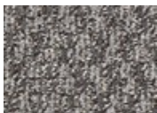
7558 Hard Rock