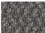
7579 Jazz Vibes