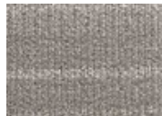
751 Art Cloth Quickship Available