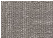
358 Reshaped Felt Quickship Available