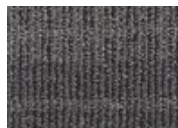
999 Tooled Surface Quickship Available