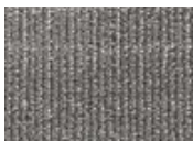
983 Wrapped Shibori Quickship Available