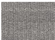
955 Bespoke Fabric Quickship Available