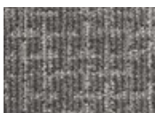
983 Wrapped Shibori