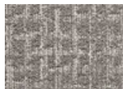
751 Art Cloth