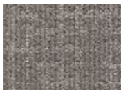
358 Reshaped Felt