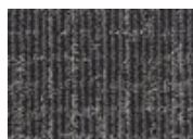
999 Tooled Surface