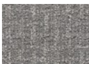
955 Bespoke Fabric