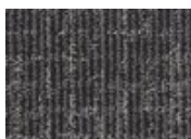
999 Tooled Surface