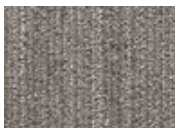
358 Reshaped Felt Quickship Available