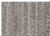
751 Art Cloth Quickship Available