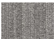
955 Bespoke Fabric