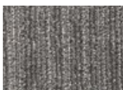
983 Wrapped Shibori