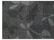
7965 River View