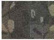
7958 Echo Valley