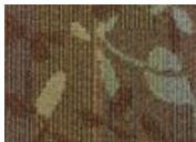
7356 Meadow Grass