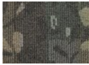
7958 Echo Valley