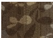
7861 North Woods