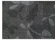
7965 River View