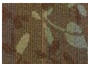
7356 Meadow Grass