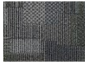
7965 River View