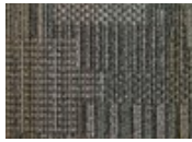
7958 Echo Valley