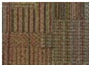
7356 Meadow Grass