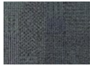
7965 River View