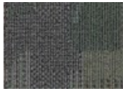
7958 Echo Valley