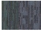
7965 River View