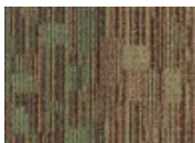
7356 Meadow Grass