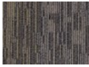
7958 Echo Valley