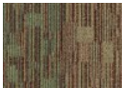
7356 Meadow Grass