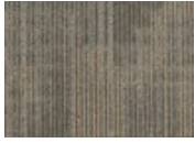
7927 Shale Quickship Available