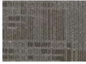
7948 Granite Quickship Available