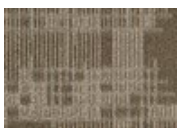
7728 Chert Quickship Available