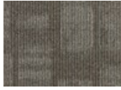
7948 Granite Quickship Available