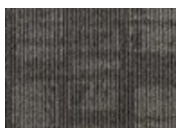
7879 Basalt Quickship Available