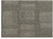
7927 Shale Quickship Available