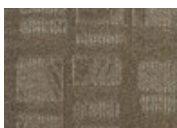
7728 Chert Quickship Available