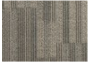
7927 Shale Quickship Available