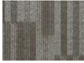
7948 Granite Quickship Available