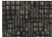
7989 Synthesis Black