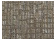
7975 Cognition Grey