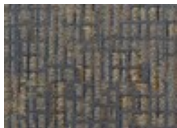
7575 Hypothesis Slate