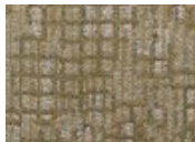
7671 Reflective Bronze