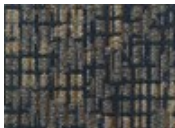
7585 Introspective Blue