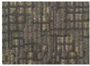
7973 Solution Charcoal