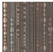
7968 Smoky Martini