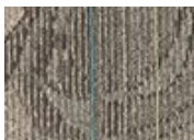
7868 Base Hit