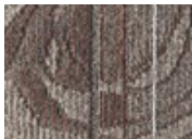
7343 Home Plate