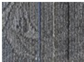
7555 Change Up