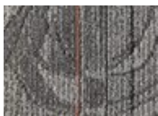
7969 Strike Zone