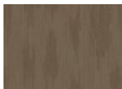
152 Living Fast