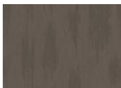
358 Thrill Seeker