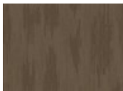
862 Tough Guy