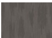
955 Cool Hand Quickship Available