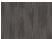
983 Roust About