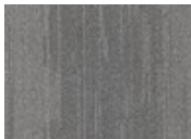
983 Roust About