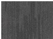
999 Leather Jacket