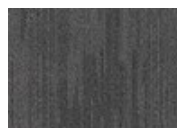
999 Leather Jacket Quickship Available