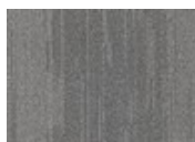
983 Roust About Quickship Available