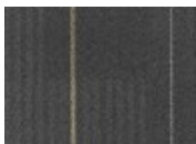
999 Leather Jacket