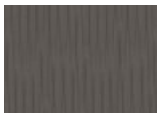
955 Cool Hand