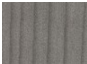
358 Thrill Seeker