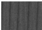
999 Leather Jacket