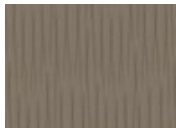
751 Dare Devil