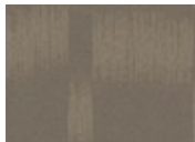
751 Dare Devil