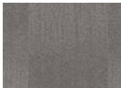
358 Thrill Seeker