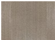
152 Living Fast