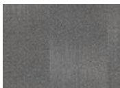
983 Roust About