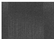
999 Leather Jacket