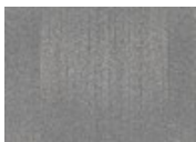
955 Cool Hand