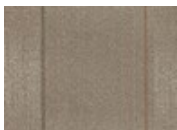
152 Living Fast