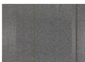
983 Roust About