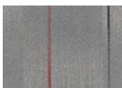
955 Cool Hand