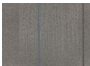
358 Thrill Seeker