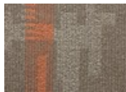
862 Tough Guy