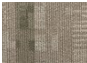
152 Living Fast