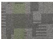
983 Roust About