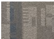
859 Glory Days