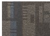
883 Wild Thing