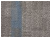
358 Thrill Seeker