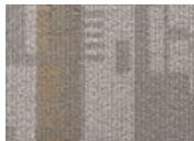
751 Dare Devil