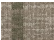
152 Living Fast