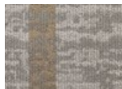
751 Dare Devil