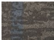
883 Wild Thing