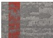
955 Cool Hand