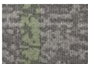
983 Roust About