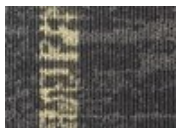
999 Leather Jacket