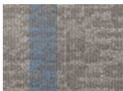
358 Thrill Seeker