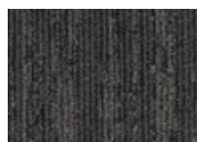
999 Daring Drift