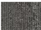
983 Clean Slate Quickship Available