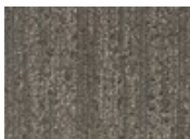
358 Classic Ridge Quickship Available