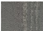
955 Solid Ground