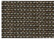
597 Roof Garden