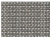
547 Aluminum Panel