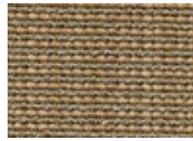
619 Cool Green Glass