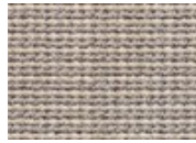
717 Ornamental Ceiling