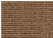
143 Decorative Molding