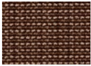
586 Wood Floor