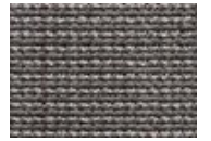
968 Artesian Tile