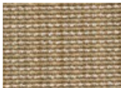
264 Floor Joist