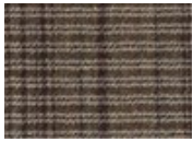
410 Great Slate