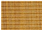
402 Cute Jute