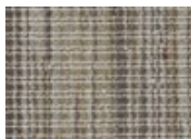
409 Gray Highway