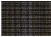
411 Cobalt Asphalt