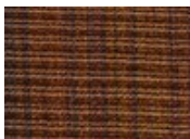
408 Down Town Brown