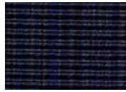
413 Wavy Navy