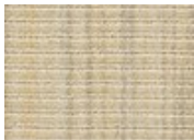
400 New Beige Rage