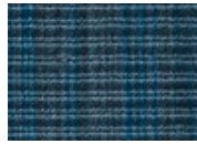
412 Cool Pool