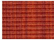
414 Slick Brick