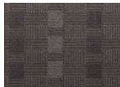
314 Union Square