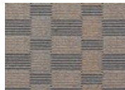
549 Empire State