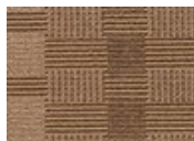
878 Brooklyn Bridge