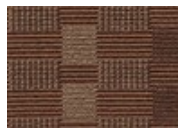
898 Radio City