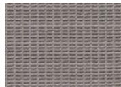
549 Empire State