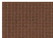
898 Radio City