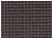
314 Union Square