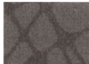
878 Streamlined Method