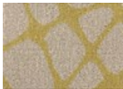
736 Visual Design