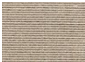
717 Design Explorations