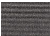
959 Functional Ideas