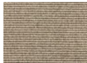
747 Technical Aspects