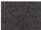
989 Creative Development