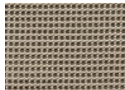
858 Theoretical Model