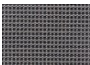
969 Product Ergonomics