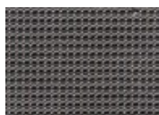
998 Analytical Skills