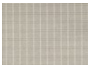
721 Wood Ash