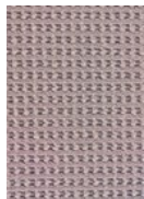
712 Grey Light