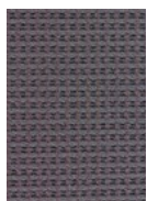
714 Grey Taupe