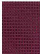
102 Cherry Wood