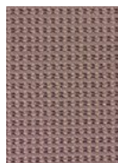
808 New Taupe