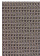
713 Hudson Grey