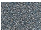
565 Regenerated Indigo