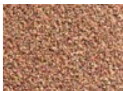
143 Exhilarating Pink