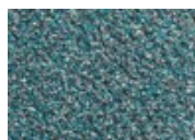
566 Saturated Turquoise