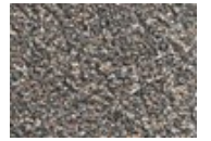
978 Keen Gray