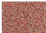
341 Brightened Red