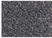
599 Pronounced Navy