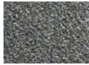
885 Latest Slate