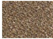
876 Distinct Olive