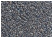
575 Renewed Blue