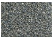
556 Invigorating Teal