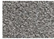
927 Revived Ash