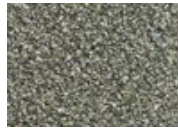
665 Refreshed Green