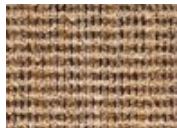
848 High Gear