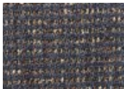
588 Hammer Down