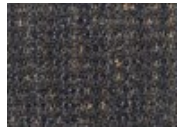
984 Super Rally