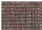
879 Victory Lane