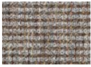
928 Speedway Junky