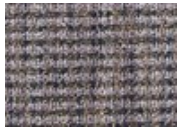
935 Free Pass