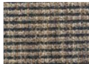
655 Fast Car