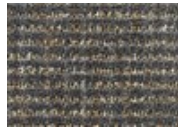
981 Checkered Flag