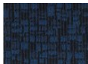
589 Magic Quickship Available