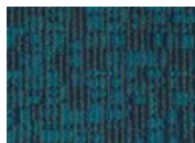
566 Peacock Quickship Available