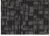
989 Mystic Quickship Available