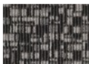
957 Metro Quickship Available