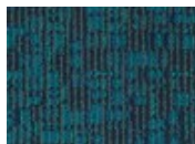
566 Peacock Quickship Available