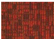
263 Cayenne Quickship Available