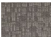
949 Everglade Quickship Available