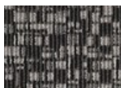
957 Metro Quickship Available