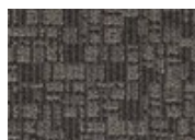
969 Cocoa Quickship Available