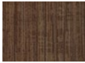
344 Natural Perfection