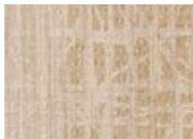
114 Organic Moire