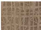
224 Contemporary History