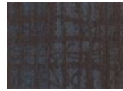
537 Cherished Ruins