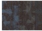
537 Cherished Ruins