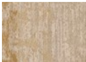
114 Organic Moire