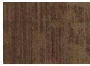
344 Natural Perfection