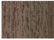
344 Natural Perfection