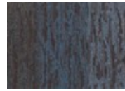
537 Cherished Ruins