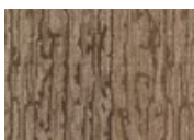
224 Contemporary History